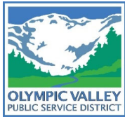
Exhibit D-8 2 Pages