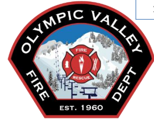
EXHIBIT F-11 13 Pages