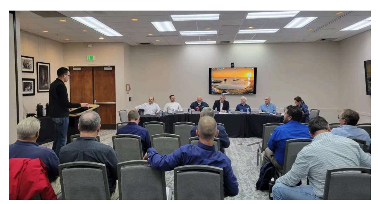
PCWA Board of Directors engaging with local utility leaders at the annual East Slope meeting in North Lake Tahoe, discussing collaborative efforts for water quality, infrastructure, and future projects.

AUBURN AND LAKE TAHOE, Calif. — Collaborative efforts among Placer County utility districts continue to pay off in both water quality and quantity, according to reports presented at the September meeting of the Placer County Water Agency (PCWA) Board of Directors. Local utility districts have tackled such issues as copper and lead levels, upgrading water meters, fighting algae blooms, and replacing water mains as well as dealt with emergencies as they continued to provide their customers with water reliability.