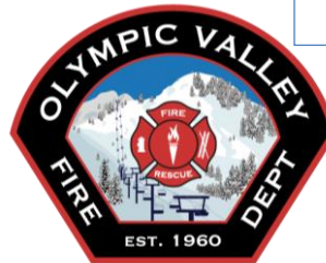
EXHIBIT F-3 7 Pages